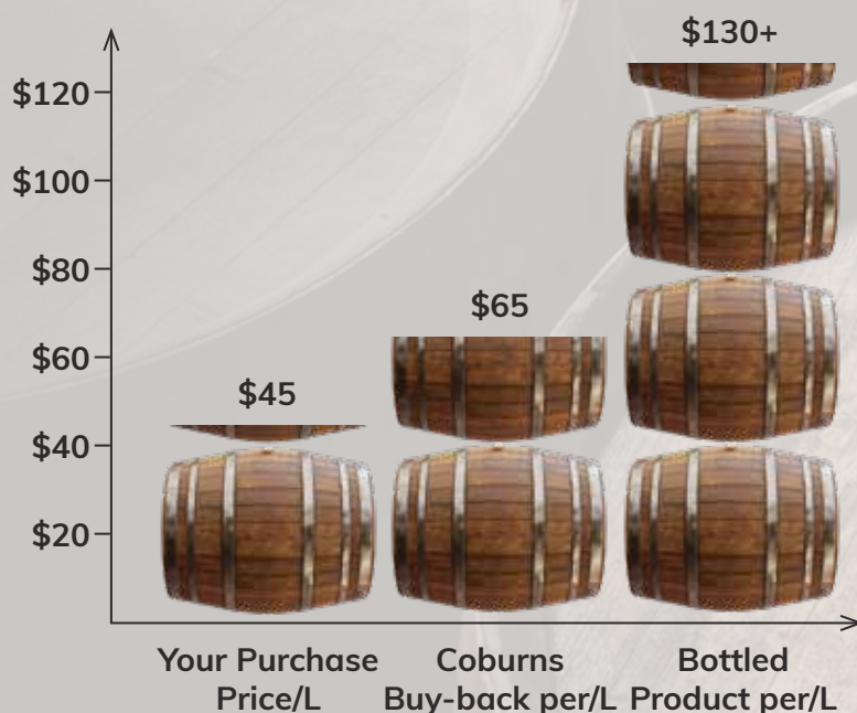
WHISKY INCREASES IN VALUE AS IT AGES This chart demonstrates how fixed returns are achieved